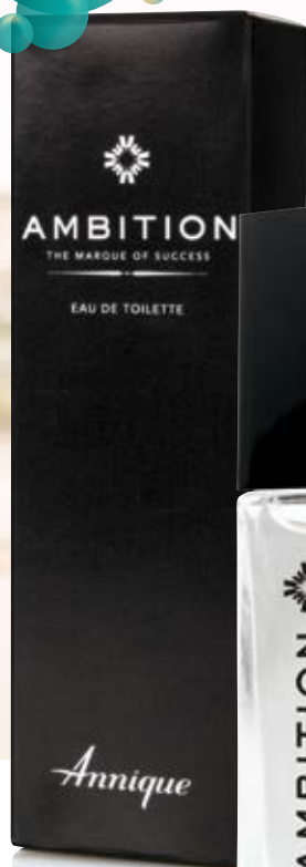
Ambition EDT 30ml AF/50103/16