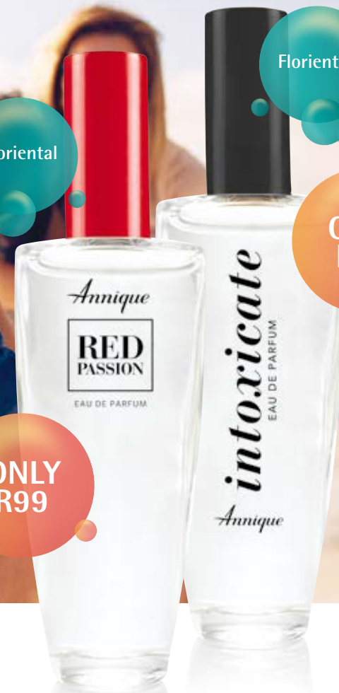
Red Passion EDP 30ml AF/10400/17